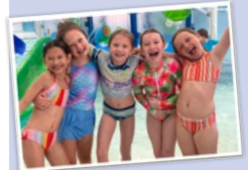
Students had a blast at the Centre during swim day!