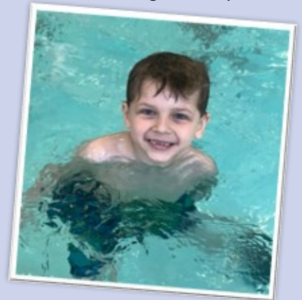
Students visit the Centre in New Richmond twice a year for swimming.