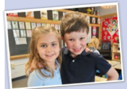
St. Mary School friendships are the best!