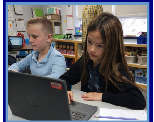
Students MAP testing on Chromebooks