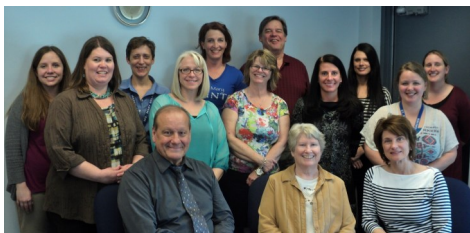
Faculty & Staff 2014-15

Please keep us in your prayers. Our St. Mary School community is dedicated to serving generations past, present and into the future.