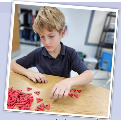
SMS was awarded a grant by FNC Bank to purchase math manipulative libraries for the elementary classrooms.