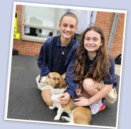
SMS Annual Pet Blessings in observance of St. Francis Assisi's Feast Day.