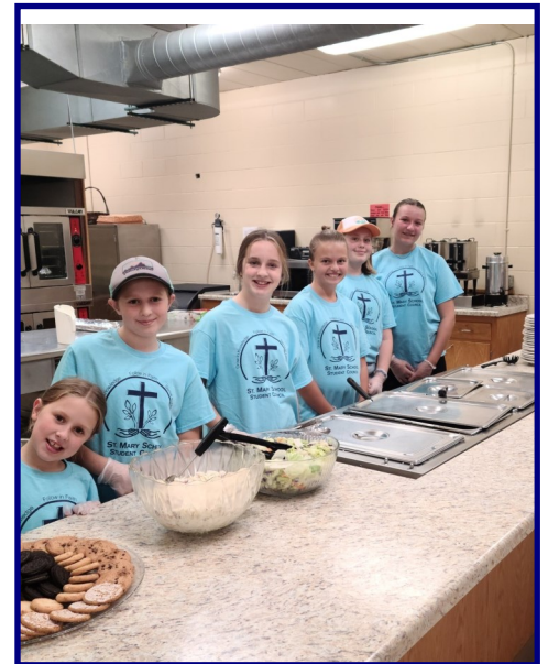
Student Council serving C.F. Dinner