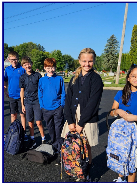
Blessing of the Backpacks on 1st day of school