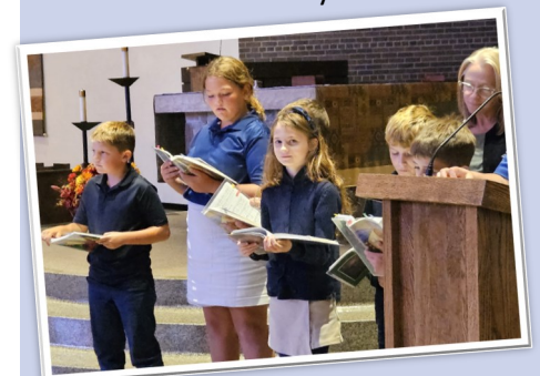
3rd Grade students leading the music ministry at Mass.