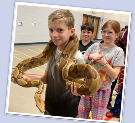
Snake Discovery Presentation