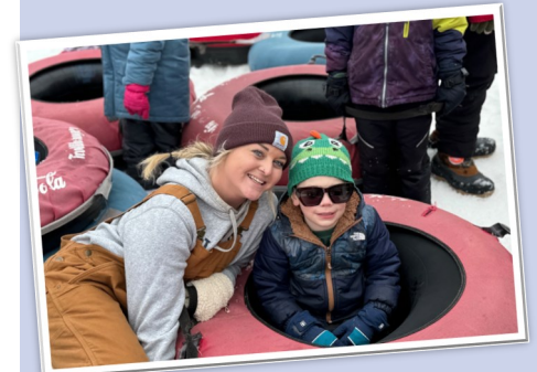
Snow tubing at Trollhaugen

lived its mission by serving in harmony and collected 523 pounds of canned goods for Five Loaves Food Shelf. Mrs. Engelhart threw out the incentive that if 500 pounds were collected, the students would earn a non-uniform day and she would wear a chicken suit! The new saying is winner, winner, chicken suit!