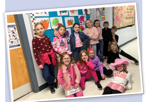
Dress like Barbie & Ken Day